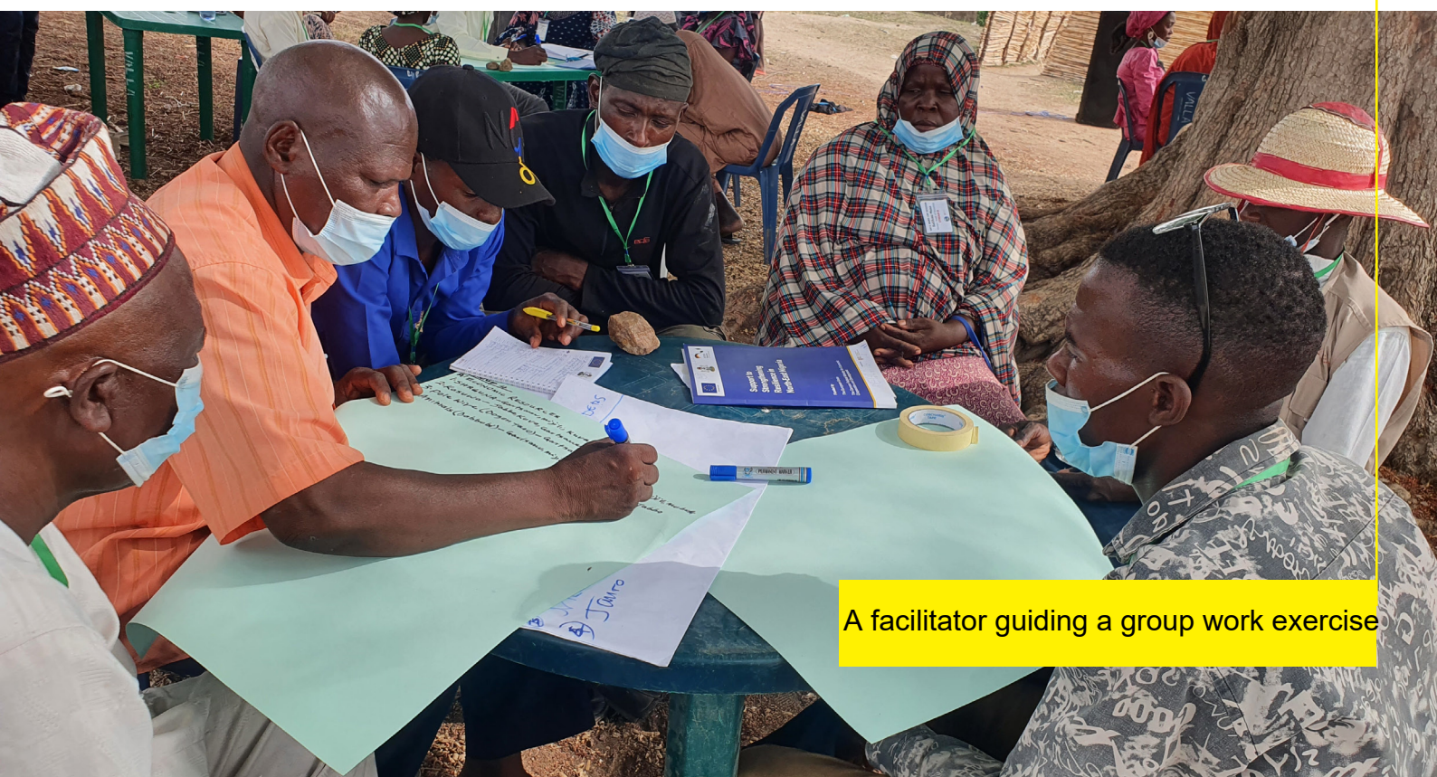
A facilitator guiding a group work exercise

In the possible near future, we envision a total absence of fear and peaceful living within and around our ward. We envision standard travers of road, strong telecommunication network and electricity and covering all parts of our ward. We are known for generosity, respect for elders and hospitality. At the cost of the CDP session, our major development challenges were identified as lack of potable drinking water, lack of hospitals and schools in some communities, limited classrooms in our schools, lack of sufficient and qualified teachers and health workers, insecurity/not enough security personnel and weapons due to the level of insecurity. These problems and challenges were clustered within seven sectors.