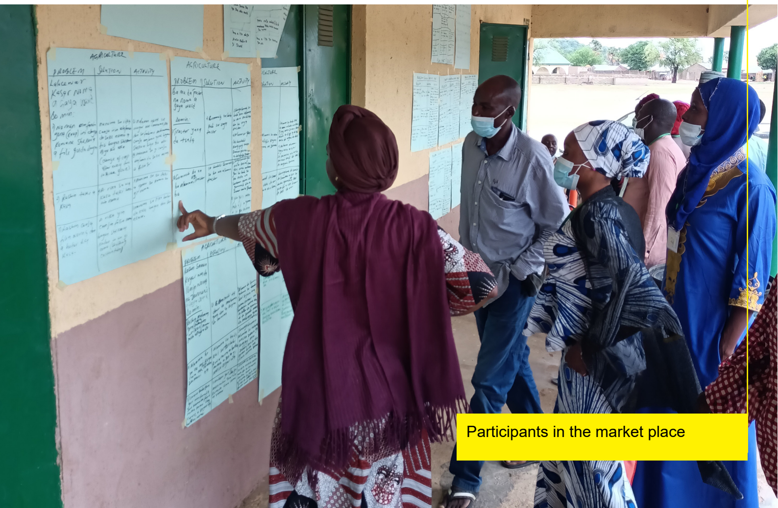
Participants in the market place