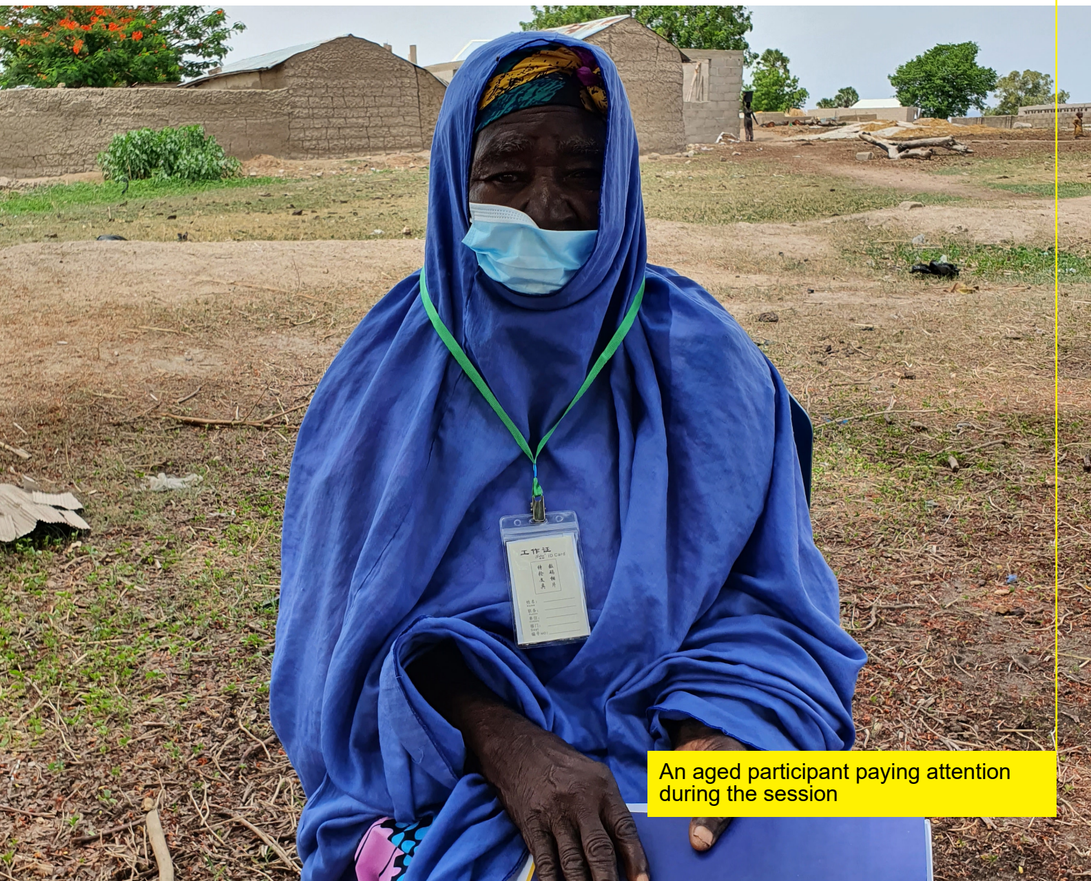
An aged participant paying attention during the session