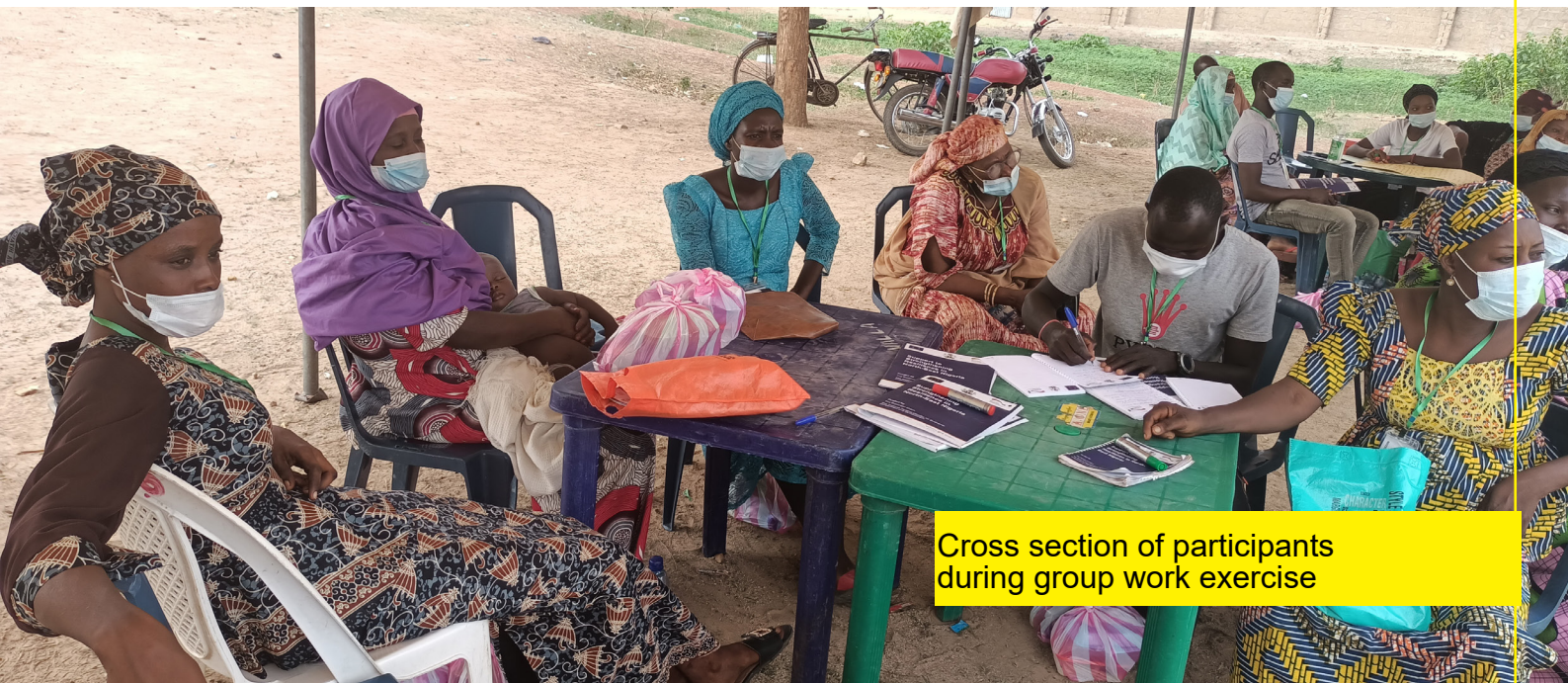
Cross section of participants during group work exercise