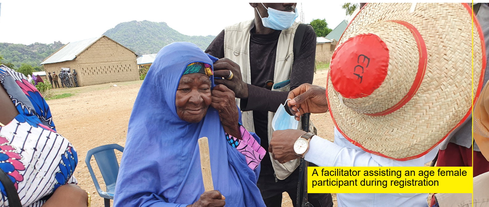
A facilitator assisting an age female participant during registration